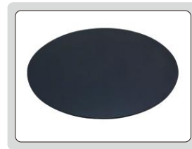
Magnetic pad (included)