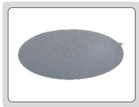
Silicon carbide paper (included)

*□□ is granularity specification, for example, code MLP-DLA40 stands for 40um