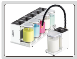
Dripping system (optional)